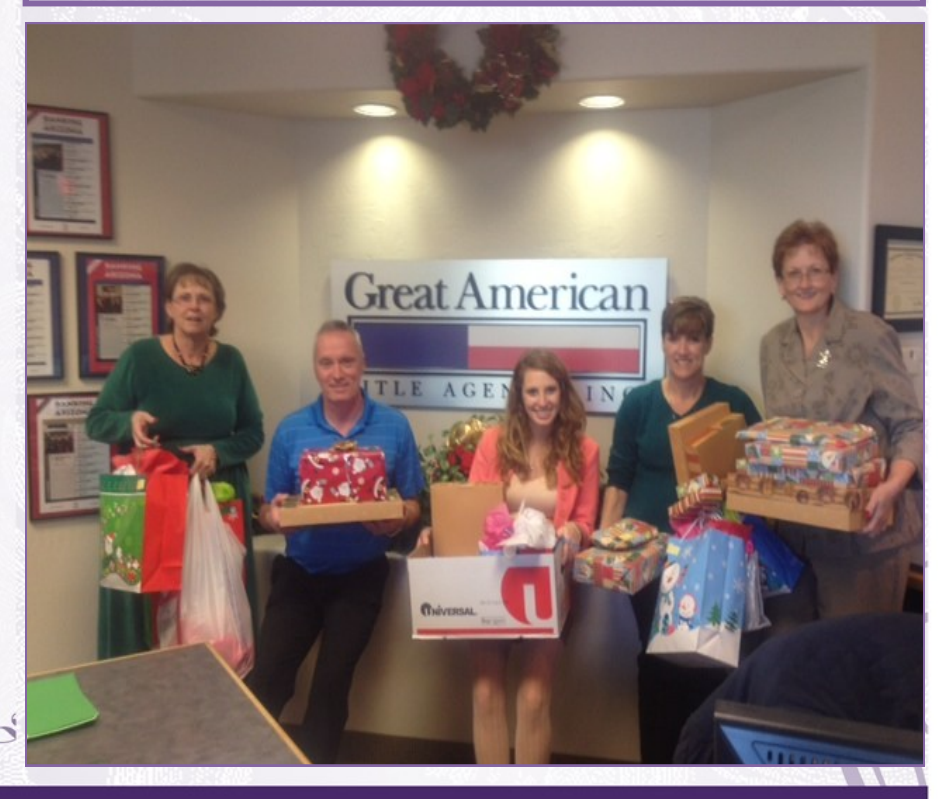
Thank You to our friends at Great American Title Agency in Mesa for sponsoring NATN-SEEDs children throughout the holiday season with your generous donation of gifts.

THANK YOU to SOROPTIMIST INTERNATONAL OF THE SAN TANS for choosing NATN as your 2012/2013 Non Profit Award Winner!