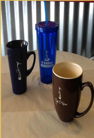
One of the many ways BDA, Inc., supports our programs